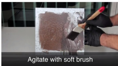
Agitate with soft brush