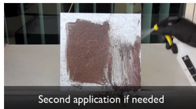
Second application if needed