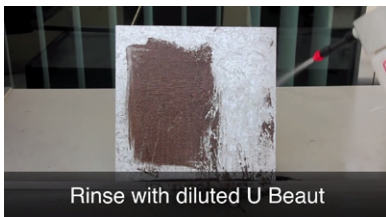
Rinse with diluted U Beaut