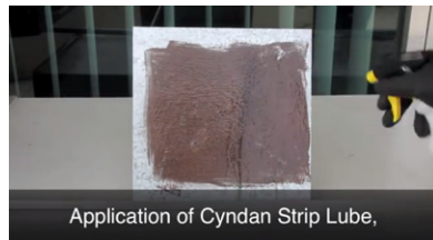
Application of Cyndan Strip Lube,