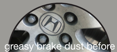
greasy brake dust before