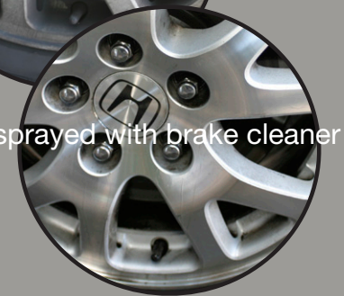
after sprayed with brake cleaner